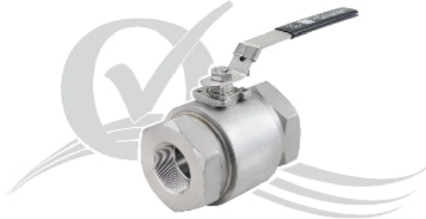
The Series HBEV valve is seal welded and non-repairable.